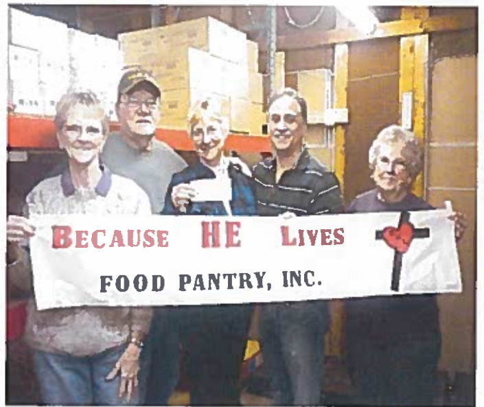
BECAUSE HE LIVES FOOD PANTRY RECEIVED A GENEROUS DONATION FROM THE COMMUNITY IMPROVEMENT CORPORATION OF THE LYNCHBURG OHIO AREA. THE DONATION IS THE RESULT OF THE CIC'S DISSOLVE. THE FUNDS IN THE CIC TREASURY WAS A RESULT OF COMMUNITY EVENTS, THEREFORE THE FUNDS ARE BEING DISBURSED INTO THE COMMUNITY.