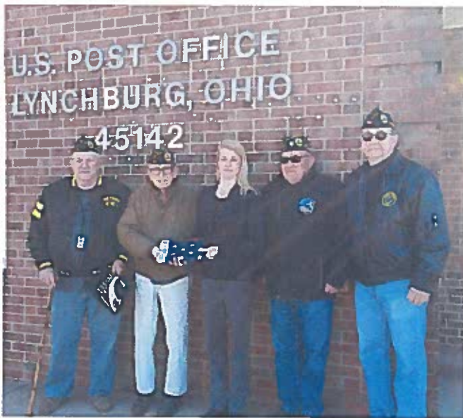
The Lloyd C. Ludwick Chapter 123 DAV flag presentation to the Lynchburg Post Office.

Thank You In Advance for your tax deductible donations.