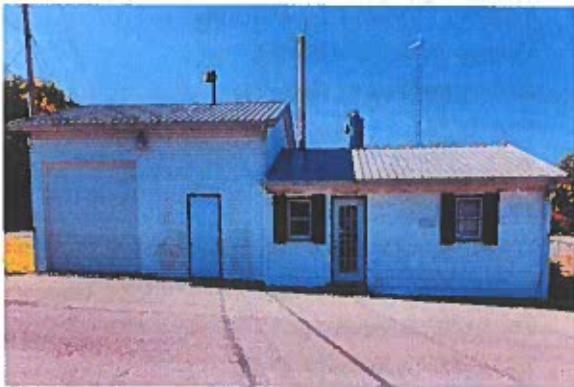
Pictured Above: "The Old Police Department"

In addition, to Case Custom Meats, I've had many conversations and meetings with the Kratzer family and a local pharmacist. I'm excited to announce that the pharmacy formally known as Krater's Pharmacy has plans to reopen to the community in the Spring of 2024.