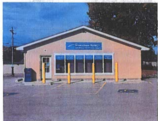
Pictured Above: Kratzer's Pharmacy

In addition, to Case Custom Meats, I've had many conversations and meetings with the Kratzer family and a local pharmacist. I'm excited to announce that the pharmacy formally known as Krater's Pharmacy has plans to reopen to the community in the Spring of 2024.